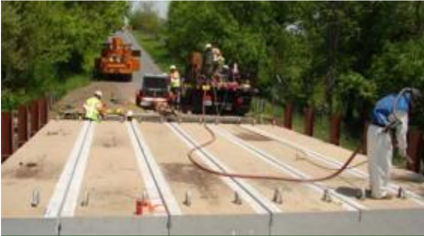
Adjacent deck beams placed side by side