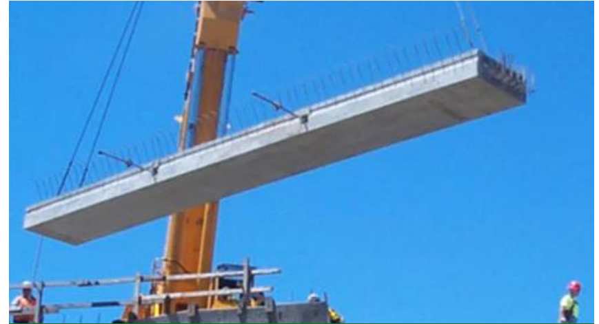
Prefabricated element construction placed by crane